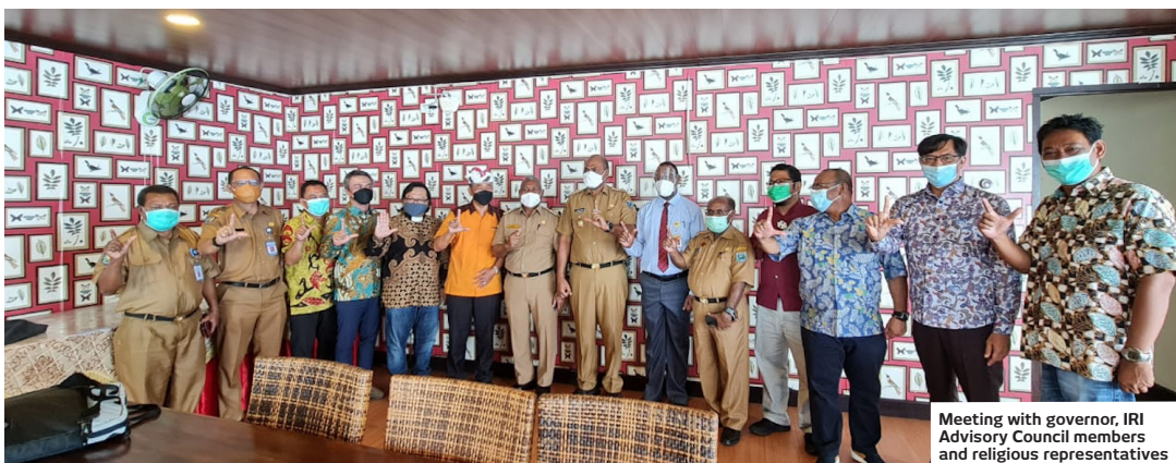
Meeting with governor, IRI Advisory Council members and religious representatives

Prior to the West Papua soft launch, IRI Indonesia met with the Governor of the province to present the Initiative's mission, mandate and objectives in the region. Several members of the IRI Advisory Council were present and had the opportunity to discuss their partnership with the initiative and previous actions to protect the tropical forests of Indonesia. The Governor along with an indigenous leader and a Christian leader all endorsed the work being developed by the initiative, and confirmed that it was in line with the province's goals: tolerance, harmony and environmentally-friendly.