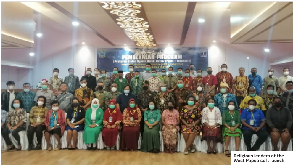
Religious leaders at the West Papua soft launch

The official IRI West Papua launch has been postponed to a later date due to political instability in the region and the pandemic. A soft launch event, however, included the participation of 100 leaders from Christian, Catholic, Muslim, Hindu and Buddhist faith communities as well as representatives from the Alliance of Indigenous Peoples of the Archipelago (AMAN). The Governor of West Papua presided over the event and shared remarks about the current situation in the region. He endorsed the soft launch of the IRI West Papua chapter in the province and welcomed the planning of an official launch event. The event also included keynote addresses on the legal and deforestation issues that West Papua faces, the protection of forests and indigenous peoples' rights, and how to implement environmental teachings from sacred texts.