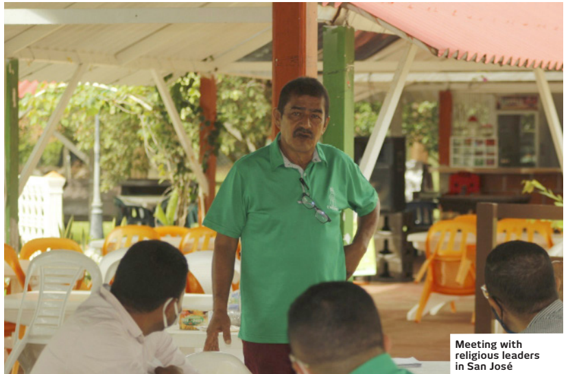
Meeting with religious leaders in San José

During the month of July, IRI Colombia and its 36 local chapters continued delivering on activities proposed in the 2021 Pastoral Action Plan. IRI San José del Guaviare , IRI Charras Boquerón and IRI El Capricho conducted awareness activities by placing messages on billboards on the conservation and preservation of forests in public places. The other local chapters will continue delivering similar activities over the upcoming weeks.