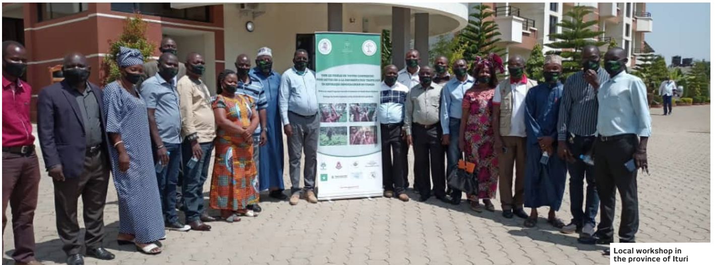
Local workshop in the province of Ituri

From June 21-24, IRI DRC held a workshop in Ituri and focused on the development of action plans. The workshop, held in Bunia, was attended by 23 leaders from various religious denominations, the provincial government, indigenous peoples representatives, civil society, and research institutions. As a guiding principle and goal, participants agreed “By 2030, all stakeholders, indigenous peoples and local communities participate in the protection and sustainable management of tropical forests, taking into consideration the laws and ethics for the well-being of present and future generations.” Both IRI Ituri and IRI Equateur used