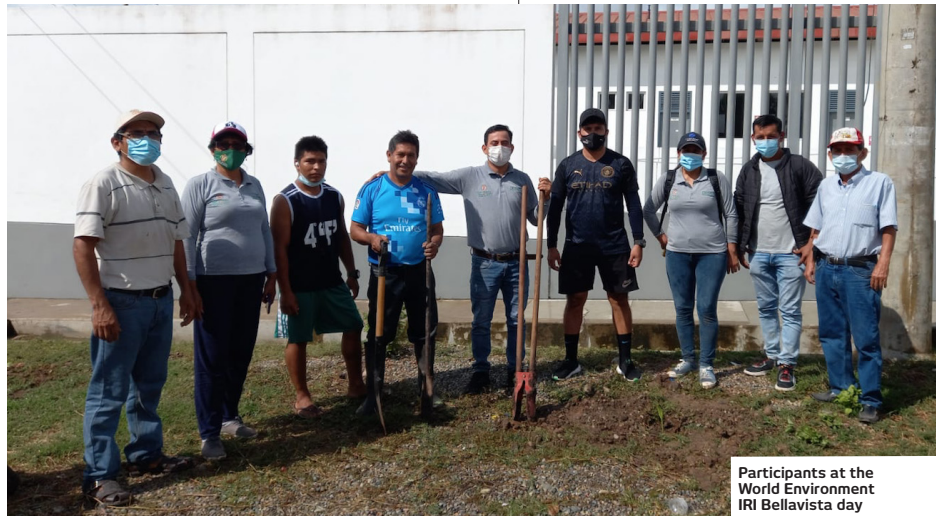
Participants at the World Environment IRI Bellavista day

On World Environment Day, IRI Bellavista organized a reforestation day to plant trees around the new MINSA hospital in Bellavista. Participants included students from IESTP Bellavista and CEBA Bellavista in partnership with the municipality of Bajo Biavo, UGEL Bellavista, Big Change and the local Economic Development Agency. The activity was in line with the “Generation Restoration” campaign launched by UN Decade on Ecosystem Restoration.